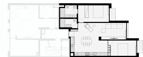
LEVEL 3 - APARTMENT 3B